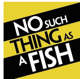
No Such Thing... (factual)