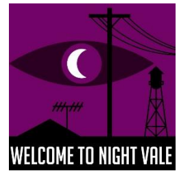
Night Vale (drama)