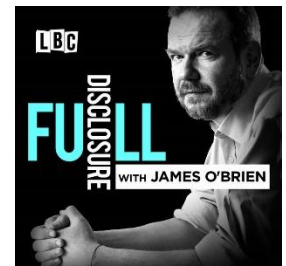
Full Disclosure (factual)