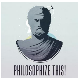
Philosophize This! (factual)