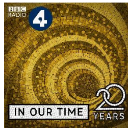
In Our Time (factual)